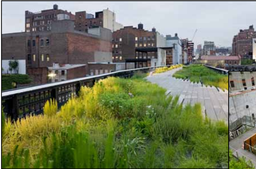
Chelsea Grasslands, between West 19th Street and West 20th Street, looking North. Iwan Baan © 2009.