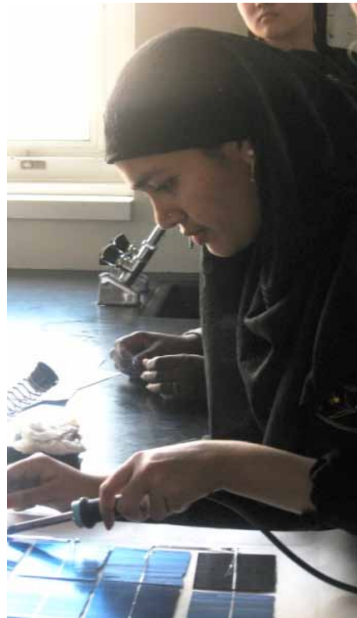
Manhattan Comprehensive student making a solar panel

Using the Green Design Lab, a Solar One educator conducts sustainability lessons integrated into regular school classes one to two days a week, over the course of the school year. The lessons cover five modules: Energy, Air Quality, Food, Water and Materials/Recycling. Green Design Lab lessons are dynamic and emphasize STEM education. Students choose a joint, school-wide sustainability project that they implement themselves – teaching leadership, teamwork, planning and communications.