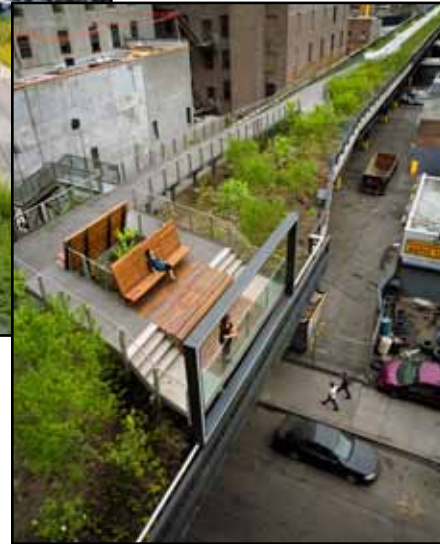
26th Street Viewing Spur, recalling the billboards that were once attached to the High Line, a frame now enhances, rather than blocks views of the city, at West 26th Street.

Join EEAC for a tour of the High Line with Mary Ann Stubbs, High Line Gardener